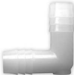
4721006 Elbow Connector