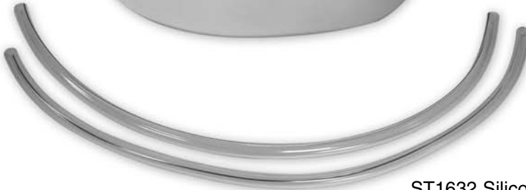
ST1632 Silicone Tubes 3 ft. length (1/2" ID)